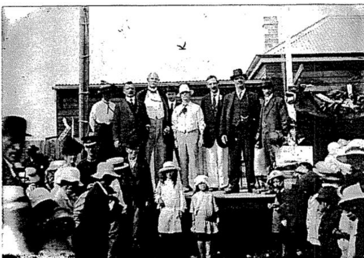
Opening of the first Carlton School Fete, December 1918