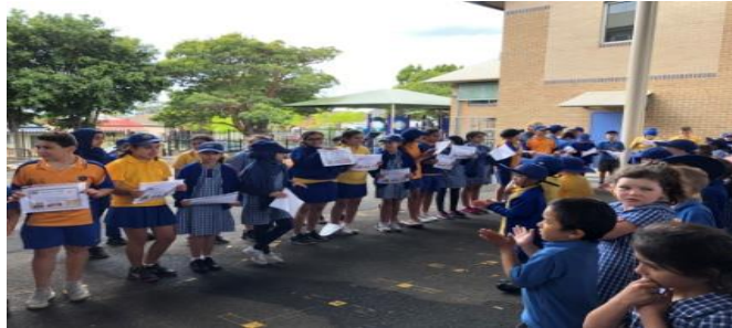
Stage 3 Mirath in Mind Awards