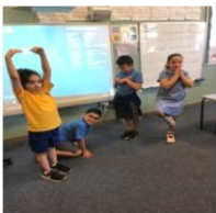
Stage 1 Tableau