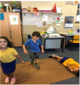
Kindy: Oh! Lovely mud.