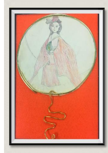
Chinese Antique Fan