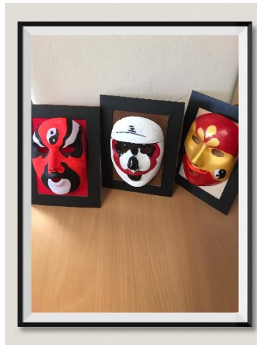
Peking Opera Masks