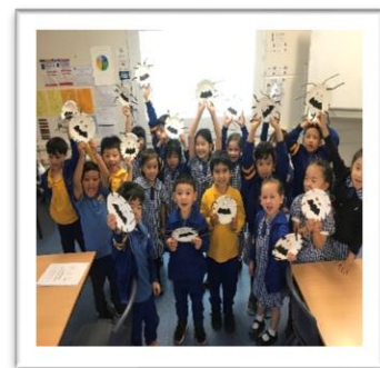
Halloween Themed Activities