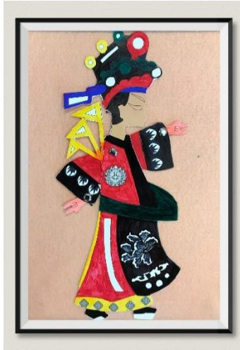
Chinese Shadow Play

It is time to celebrate. Students from Kindergarten to Year 6 have been learning about Festivals and Celebrations for the past seven weeks. They have studied food, costumes and traditions associated with festivals around the world. Let's celebrate together to recognise our students effort and enthusiasm in learning Chinese for 2020.