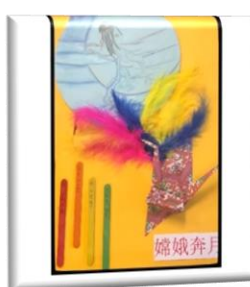
Poetry is expressed in artistic form